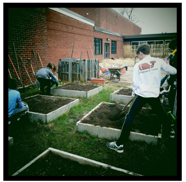
Students working to prepare beds for spring planting

The Middlebrook Family & Consumer Science class is mandatory, which aligns with our school's cultural value of helping students make better choices around food and nutrition. Sixth grade students cook and prepare vegetables that they themselves grow and harvest in the school garden. This curriculum focuses on growing and consuming vegetables that are in season. The 7th grade baking and pastry arts curriculum focuses on teaching students how to make healthy substitutions in baking. This includes replacing saturated fats with heart healthy oils, using fruit and vegetable purees and providing gluten free options. The 8th grade culinary arts students study a variety of healthy grains, especially those grains that have recently entered the culinary lexicon. Students learn different ways to prepare healthy grains and incorporate these into their daily diets. Eighth graders also learn how to prepare a variety of healthy vegetarian and vegan dishes, such as chickpea curry and baked eggplant fries.