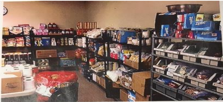
Superior School Pantry

a natural extension of previous efforts to collect coats, hygiene products and school supplies for students. "We're a part of this community and we need to support it" he said.